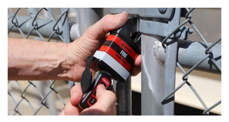
KLS-3784 shrouded padlocks offer maximum attack resistance against shackle cut, deterring unauthorized entry.